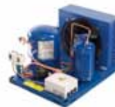
Optyma Condensing Units

Our products can be found in a variety of applications such as rooftops, chillers, residential air conditioners, heatpumps, coldrooms, supermarkets, milk tank cooling and industrial cooling processes.