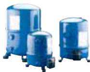
Maneurop Reciprocating Compressors