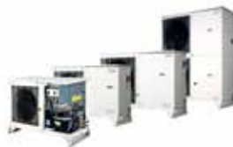
Optyma Plus Condensing Units